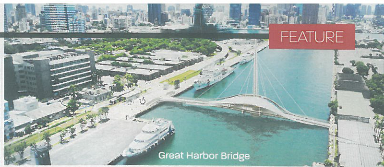
Great Harbor Bridge